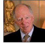
Baron Jacob Rothschild

Who's Behind the New World Order? See Pages 10-11