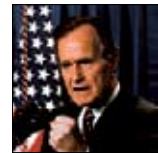
George H.W. Bush