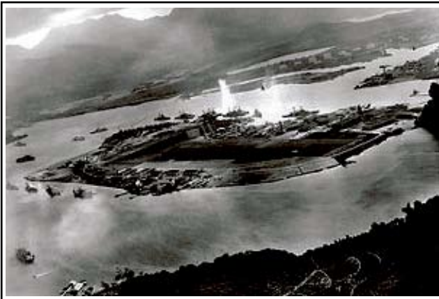
Aerial view from a Japanese airplane at the start of the bombing of Pearl Harbor on Dec. 7 1941. Was it really a 'sneak attack?'